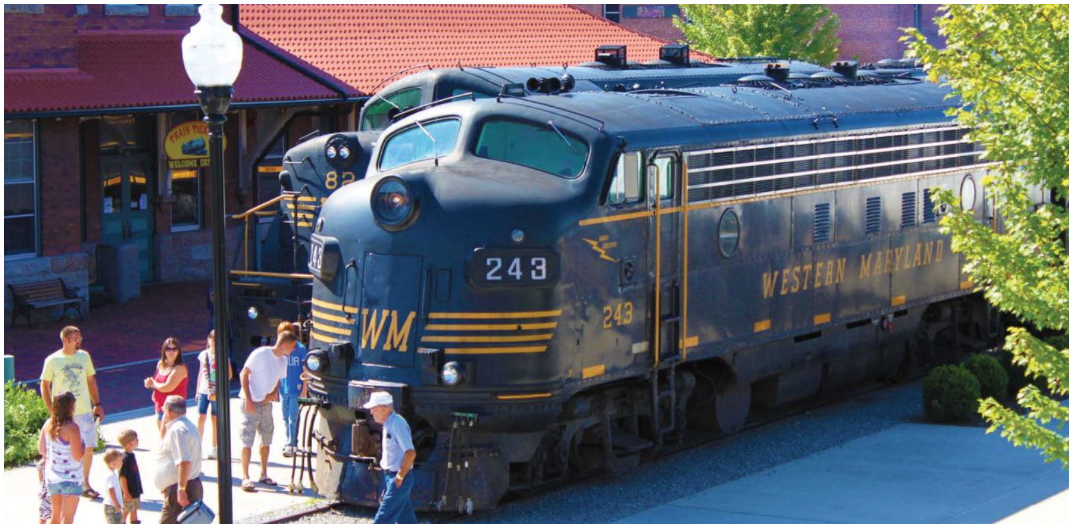
Ride the Potomac Eagle Scenic Railroad along the South Branch of the Potomac River