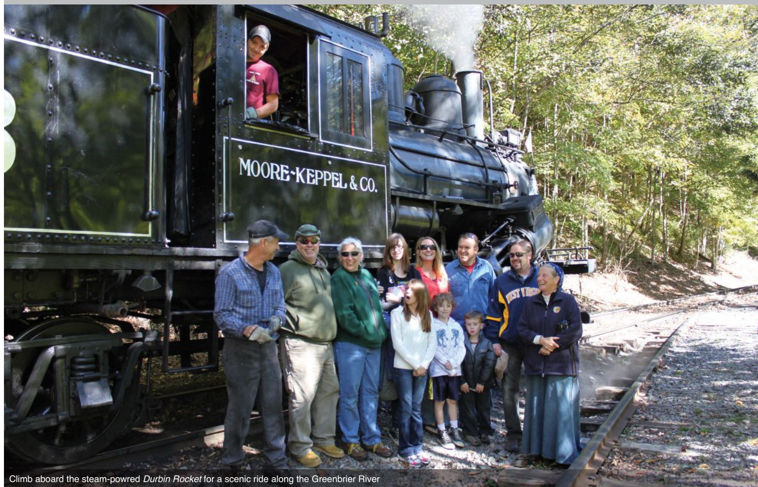
Climb aboard the steam-powred Durbin Rocket for a scenic ride along the Greenbrier River