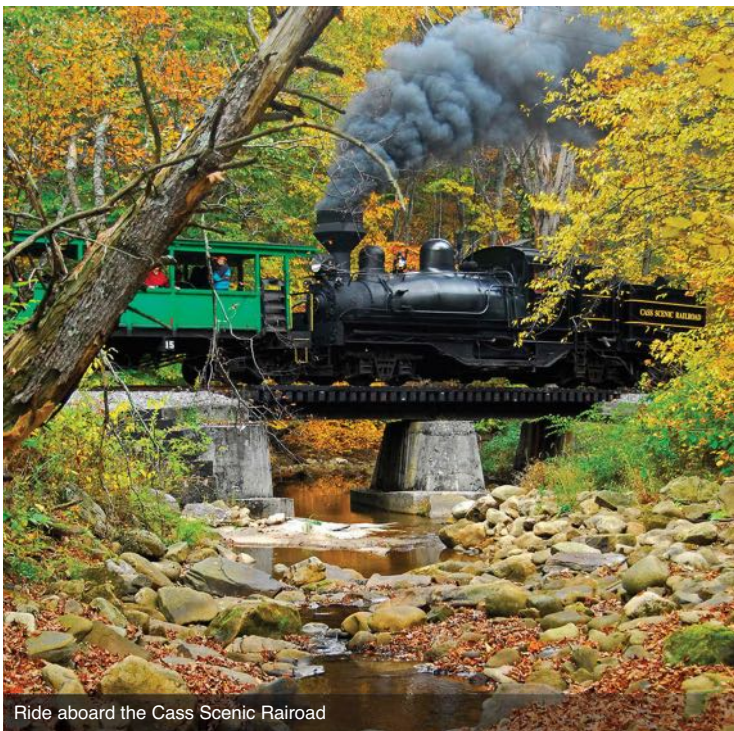
Ride aboard the Cass Scenic Railroad

picturesque South Branch of the Potomac River. Enjoy your included dinner onboard the train and watch for the many eagles which call the area home. (Breakfast and dinner)