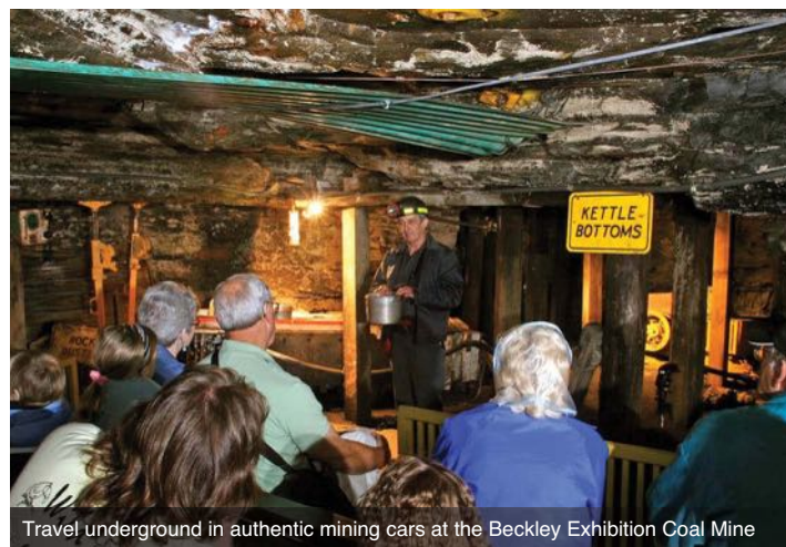
Travel underground in authentic mining cars at the Beckley Exhibition Coal Mine

Touring this morning is in Morgantown, where we hear tales of the hometown hero Don Knotts starting with his alma mater, West Virginia University. See Fife Street, which inspired the name of his most memorable character and his star on the sidewalk outside the beautifully restored Metropolitan Theater where he performed in his youth. Learn about Don's most daring adventure from high atop Cooper's Rock and visit Spruce Forest Artisan Village for unique local area crafts and souvenirs. Later, the Potomac Eagle Scenic Railroad brings us along the