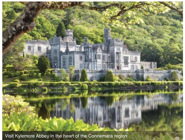
Visit Kylemore Abbey in the heart of the Connemara region

Filled with memories of the Emerald Isle, transfer to Dublin Airport for your flight home. (Breakfast)