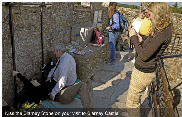
Kiss the Blarney Stone on your visit to Blarney Castle