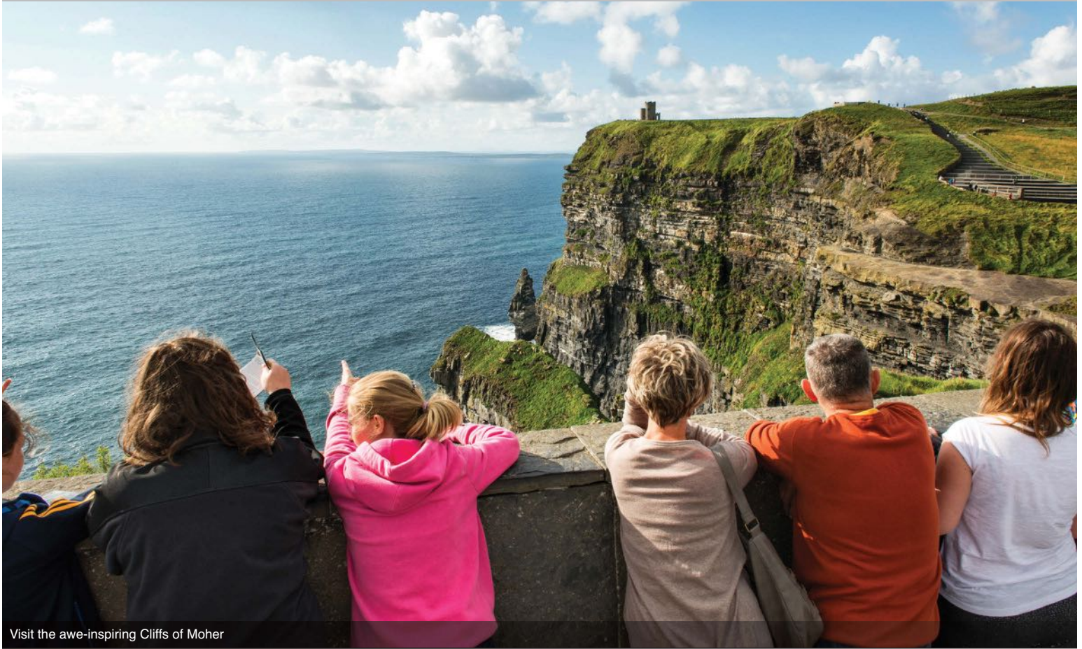
Visit the awe-inspiring Cliffs of Moher