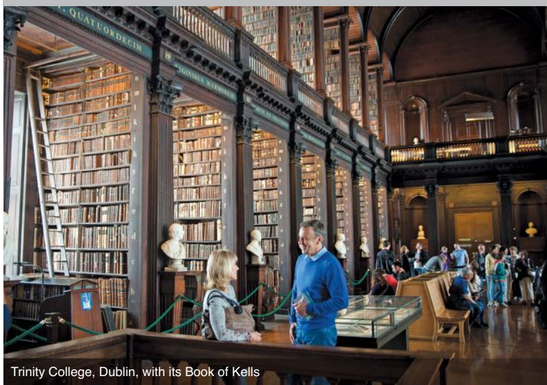
Trinity College, Dublin, with its Book of Kells