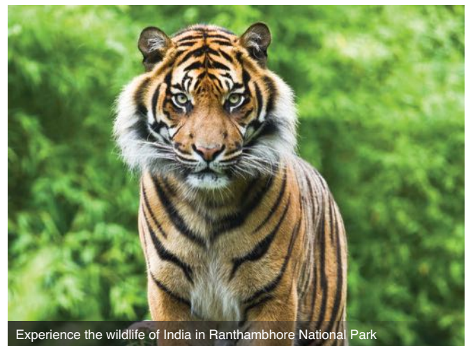
Experience the wildlife of India in Ranthambore National Park

After a relaxing morning, journey back to Delhi. With a late afternoon arrival, visit the Bangla Sahib, the most prominent Sikh house of worship in Delhi, before enjoying an included dinner. After dinner, transfer to the airport for the flight home. Due to the day's logistics, flights should depart Delhi after 10:00pm. (Breakfast and dinner)