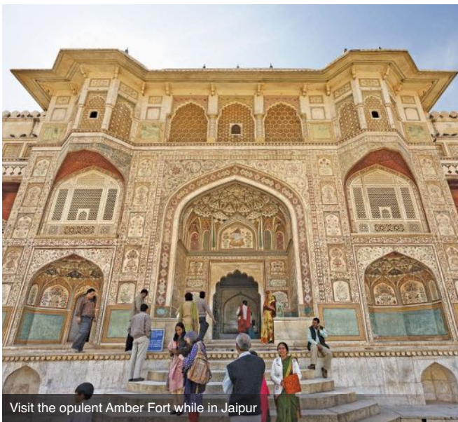
Visit the opulent Amber Fort while in Jaipur