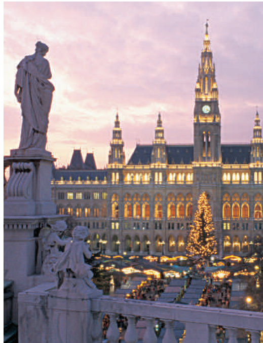
Christmas Markets in Vienna, Austria