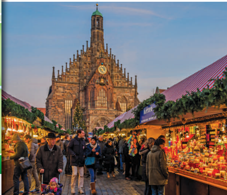
Nuremberg's Christkindle Market – one of Germany's oldest