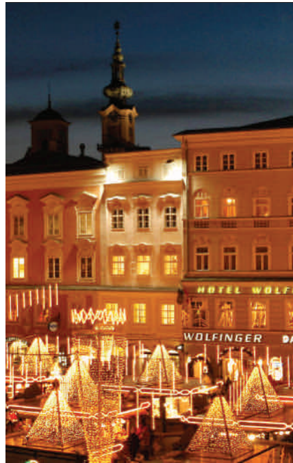
Shop for treasures at the Christmas Market in Linz