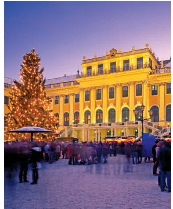
Vist the regal Schönbrunn Palace decorated for the Holidays