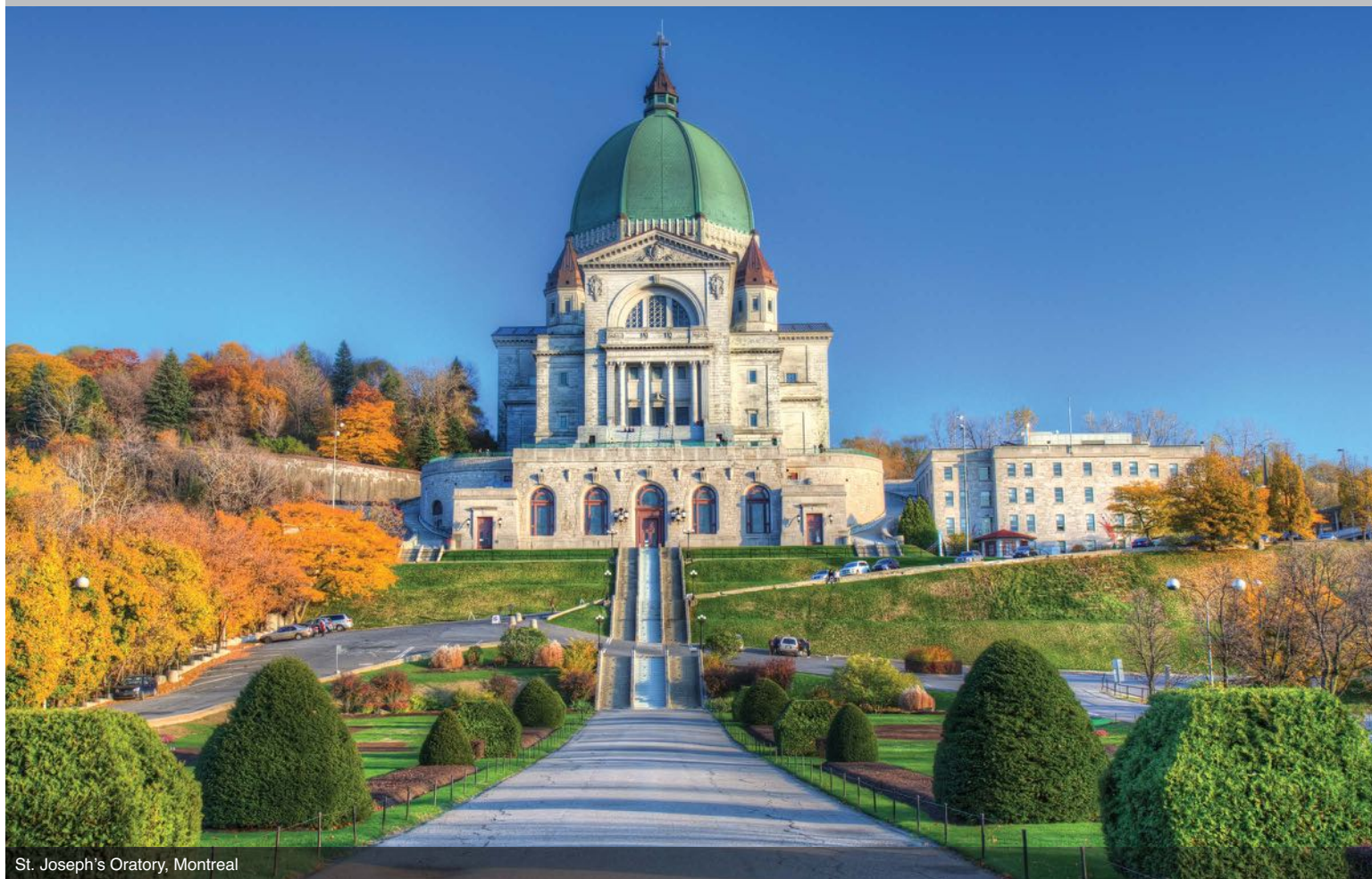
St. Joseph's Oratory, Montreal