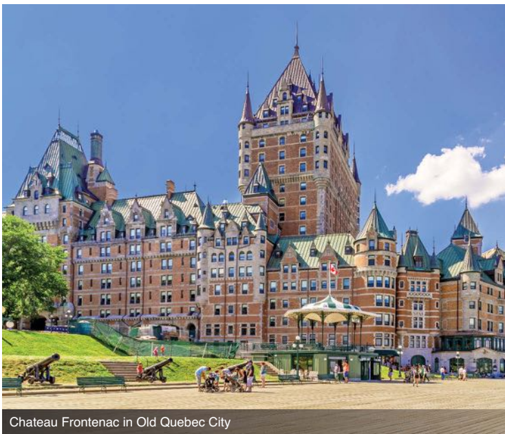
Chateau Frontenac in Old Quebec City

Lawrence River and Place Royale, the oldest settlement in the region. Later we see the majestic Parliament Buildings before arriving at the Plains of Abraham, the site of the famous battle of 1759. Tonight, a special Sugar Shack dinner will introduce us to Quebec's unique culture complete with a maple syrup making tour, musical entertainment and traditional French Canadian cuisine. (Breakfast and dinner)