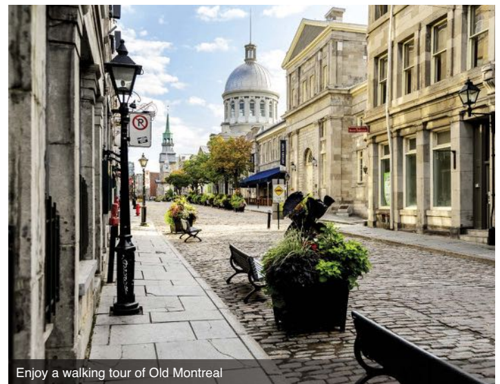
Enjoy a walking tour of Old Montreal

After breakfast, Canada's VIA Rail service takes us to Quebec City. The only walled city in North America, Quebec's Grande-Allee is alive with many quaint shops and sidewalk cafes. On our touring today we pass under the famed St. Louis Arch which leads into old Quebec. We arrive at the banks of the St.