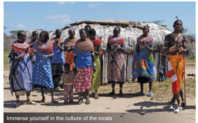
Immerse yourself in the culture of the locals

After breakfast, depart with picnic lunch boxes for a full day of game-viewing drives on the Serengeti plains. 'Serengeti' is derived from a word meaning 'the place where the land runs on forever', and the vast national park remains true to its name.