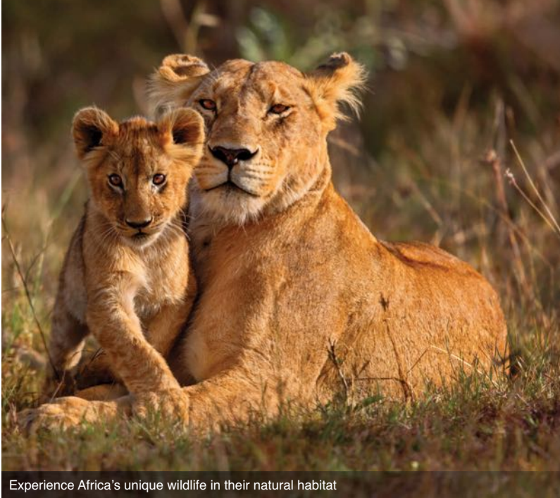
Experience Africa's unique wildlife in their natural habitat