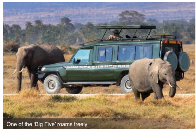
One of the 'Big Five' roams freely

Your African Safari Adventure comes to an end as you depart for Nairobi, taking with you memories and photographs of the special moments and unforgettable experiences. Lunch is included before arriving at the Jomo Kenyatta International Airport for your flight home. (Breakfast and lunch) (Arrival at your home city may be on Day Fourteen based on flight schedule)