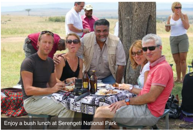
Enjoy a bush lunch at Serengeti National Park

Aside from being spoiled by the variety of wildlife and bird species of the Serengeti, its landscape is stunningly beautiful, especially in the early morning and late evening light. Elephant, buffalo, lion, rhino, zebra, giraffe and others may be spotted during your Serengeti adventure. An early morning optional excursion, Balloon Safari at Dawn, prior to the included game drive, may be available (weather permitting).