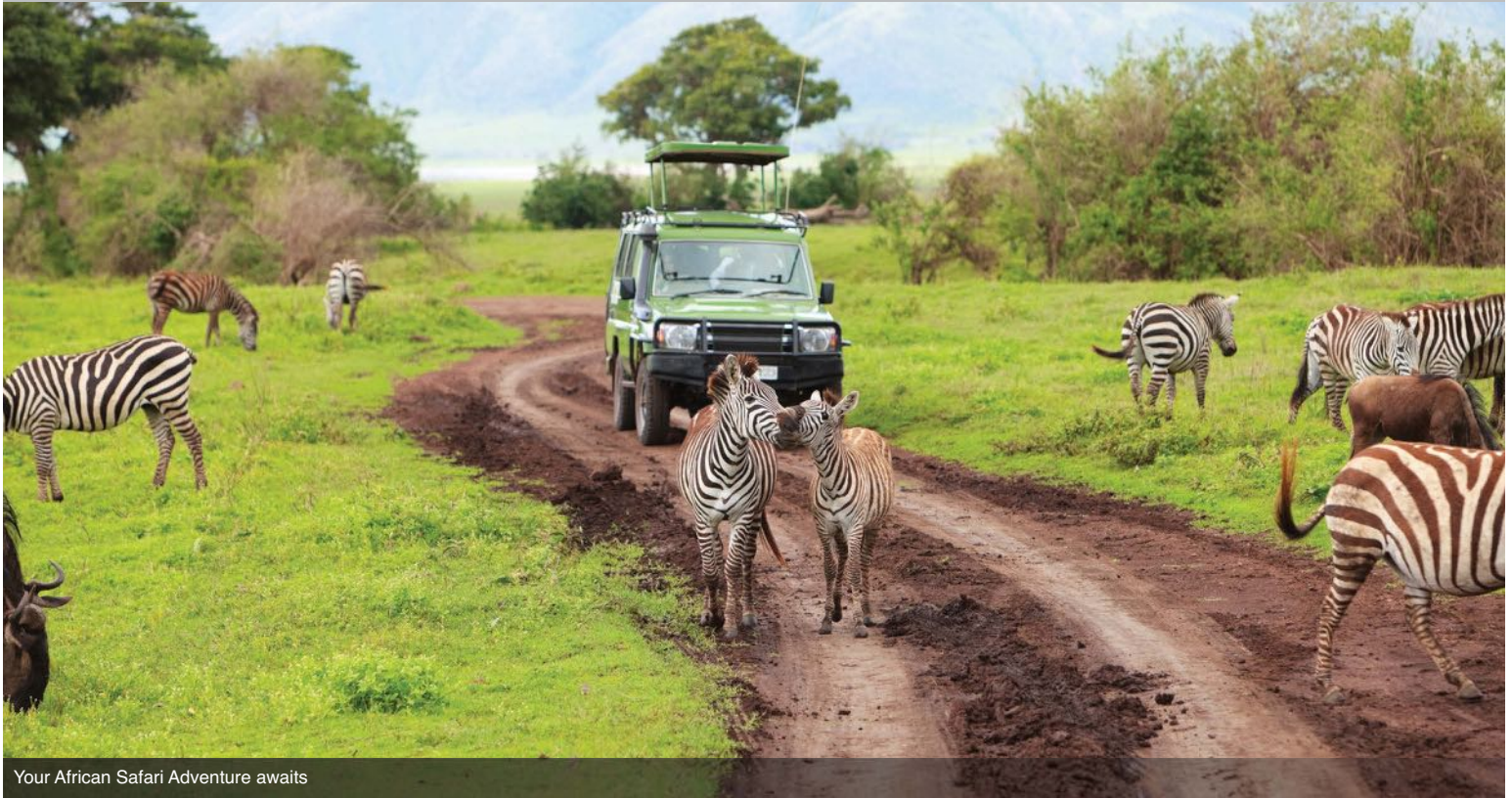
Your African Safari Adventure awaits